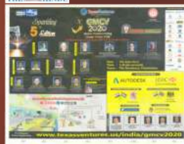
Half page Advertisement in The Hindu