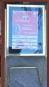
Standing Display Board