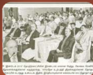
Event Coverage in News Papers