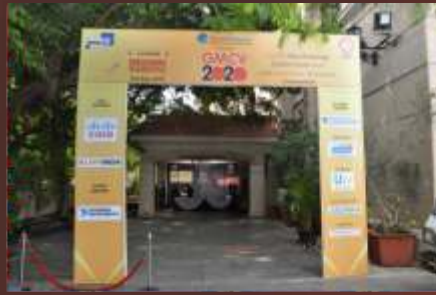
Arch at the Entrance of the Conference Venue