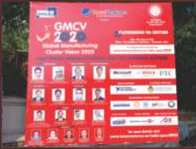
Hoarding at the entrance of the Exhibition Venue